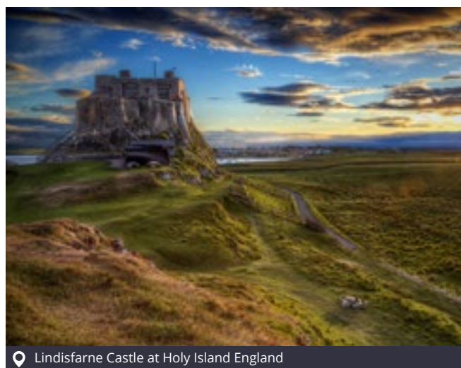
Lindisfarne Castle at Holy Island England

There are two sections in the Plan currently open to new joiners. Both sections are defined contribution pension arrangements. The chart below explains the differences.